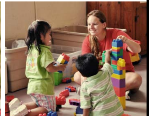
YOUTH IN MISSION FIELD! 16 youth & 5 adults traveled to Onancock, Virginia in July for a mission trip. They helped with “Kids Klub” and did local work projects!